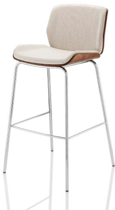
Kruze bar stool