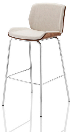
Kruze bar stool