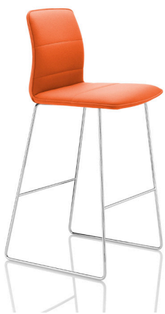
Arran bar stool